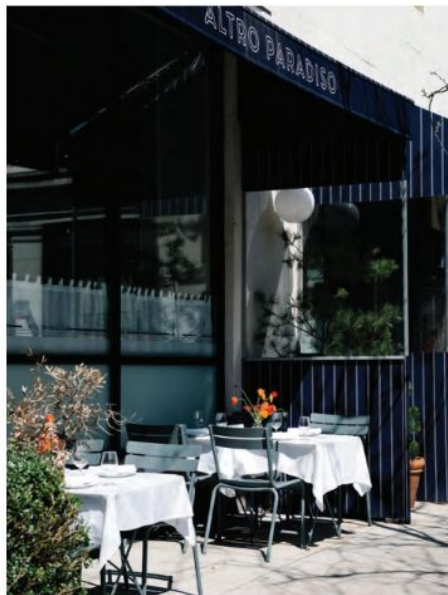
This page (from top left): Altro Paradiso, New York, USA; Ogata, Paris, France; Scorplos, Bodrum, Türkiye. Right page: Al Moudira, Luxor, Egypt