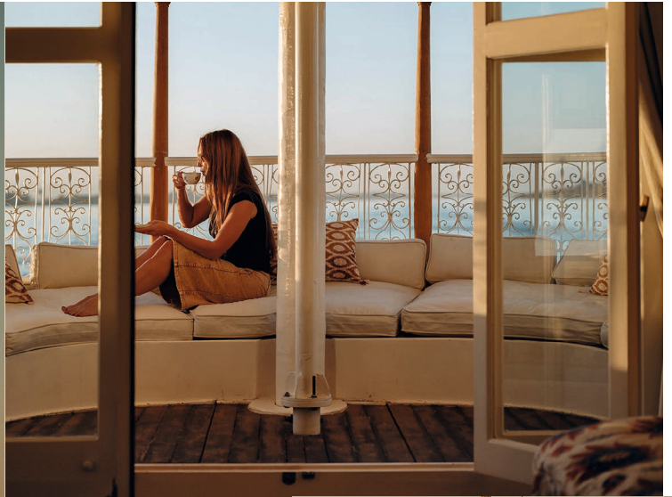
The 100-year-old Set Nefru dahabiya adrift on the Nile. Opposite: Al Moudira's courtyard; a luxury suite in the hotel; its main pool