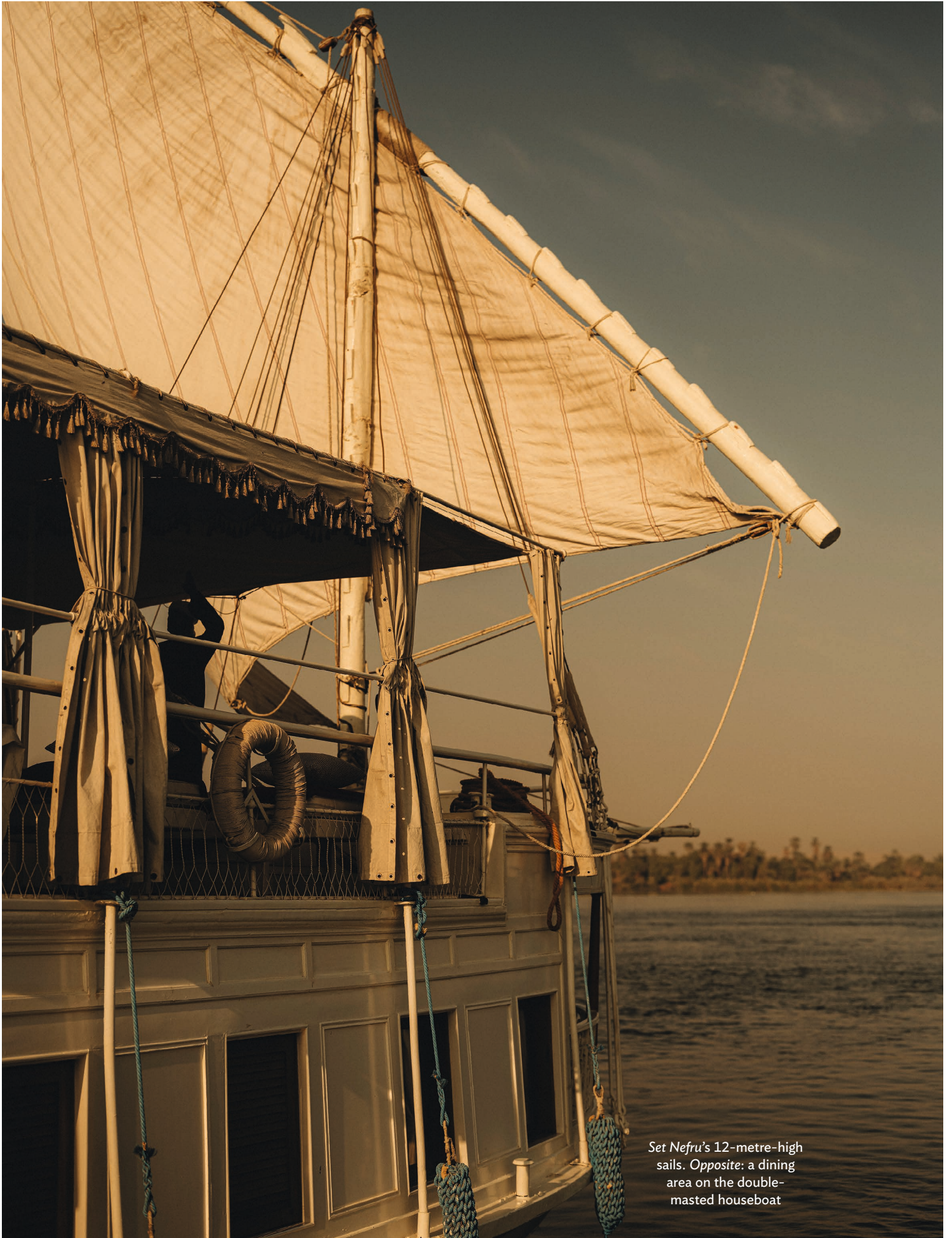
Set Nefru's 12-metre-high sails. Opposite: a dining area on the double-masted houseboat